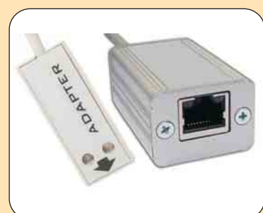
LAN adapter for communication with the PC via LAN network