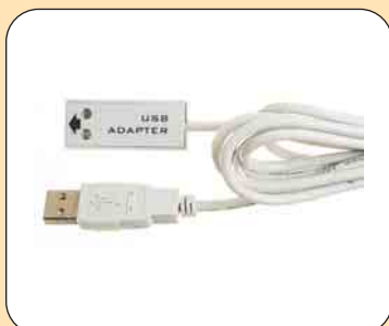
USB adapter for communication with the PC via USB