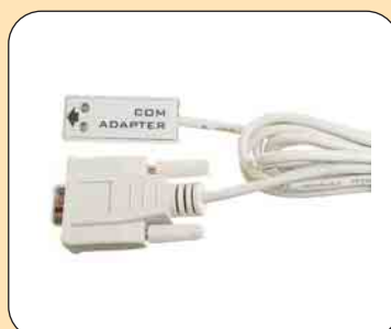
COM adapter for communication with the PC via COM port