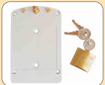
F9000 wall holder with lock