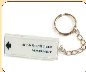
LP004 start/stop magnet